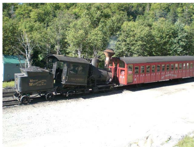
A train ready to depart the station for the climb up the mountain.

As you leave the station at the base, immediately you start to climb. A short while after leaving, the station will disappear while you continue on. On a clear day, you can see all the way to the top and watch the trains ahead of you still climbing up or descending. There can be up to seven