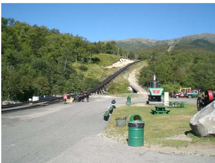
The view up the mountain from the station area.

Today, the Mount Washington Railroad is very easy to find and is just off Route 302. It is only a few miles from the highway. There is free parking at the base with a large souvenir shop with very reasonable prices. Here also is a snack bar and ticket office. The trains start right outside the door. There are no provisions for pets and they are not allowed on the trains.