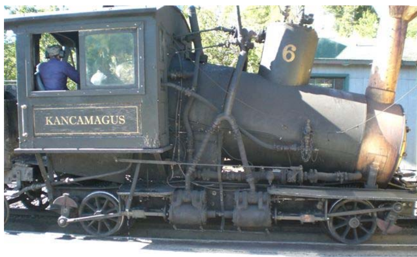
The steam locomotive Kancamagus, note the angle of the boiler, when the engine climbs the mountain the boiler is level.

trains on the mountain at one time. You will note the unique passing sidings with the switch's handling not only the two rails but also the cog gear rail. The round trip takes about three hours, with a twenty minute stop at the top.