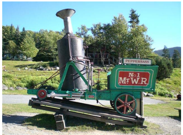
This is the engine called Peppersass and was the original design for the cog railway locomotives in 1866 now on display.

He also came up with a safety device. The first air brake controlled by compressed air. Marsh was granted a patent which was five years ahead of Westinghouse's air brake. This system allowed the train to slowly come back down the mountain.