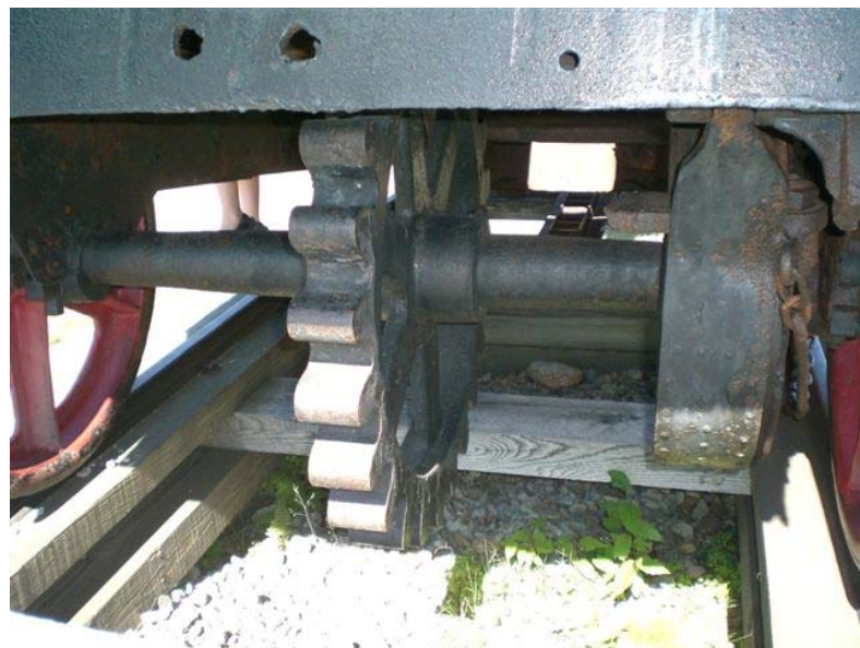
The cog on the locomotive that engages the rack to propel the train up the mountain.