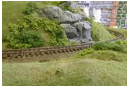
The hand carved rocks on Korchefsky Ridge.