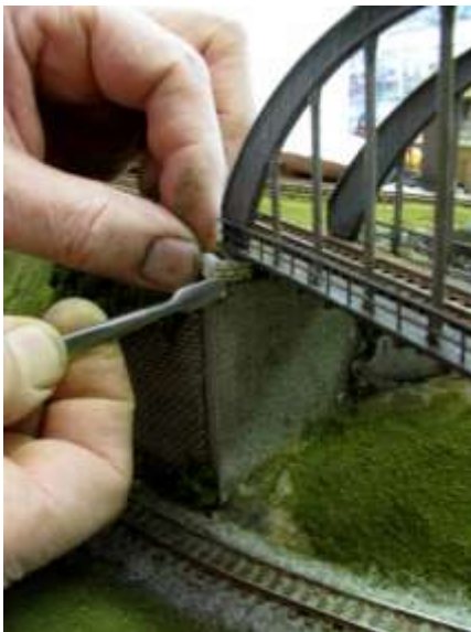
Paul says it is the little things that modellers forget to add that changes an average layout into an outstanding layout. Here he adds the retaining wall that will hold the ballast.