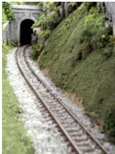
Tunnel portal at the Lawson's Landing end of Seymour Pass.