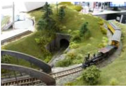
Testing the track on the upper level, our 4-4-0 passenger train rounds Korchefsky Ridge.

Details Details Details. All I can say is it has to be seen to be believed. Retaining walls, weathered track and ballast make the scene look realistic. The Grass-o-Mat was brought out today to highlight the long grass. Jos Geurts Trees really add to the effect. Watching Paul work is amazing. He starts with white plaster area, squirts white glue full strength from the bottle, then dips a paint brush in water and spreads the glue. A sprinkling of ground colour turf making sure to get 100% coverage. He lets it sit a couple of minutes, then vacuums off any loose particles. Another layer is added using the same technique, this time he sprinkles a green turf and makes sure it is not 100% coverage. After vacuuming, a third layer is applied with a different shade of green, a final third layer of a third shade of green is applied, each successive layer is applied so that it accents the layer below. To change the shades of the green turf, Paul puts some turf in a small container, adds some dry yellow pigment to the turf (weathering powders would work). In the evening Will and Paul go off to Will's railroad club, the Muskoka Model Railway Club. Here Paul sees the 12m x 3.5m HO DCC layout the club runs, as well as the portable 3m x 5m N scale layout they take to train shows.