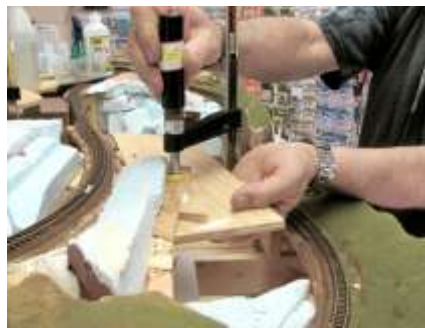
Adding the plywood base for the little town of Lawson's Landing.