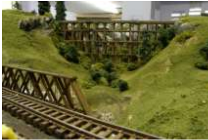
The realism of the gorge and the two bridges is seen here.

Today was the day that Paul tackled the trestle gorge and lake area. The double track bridge had to be aligned perfectly. Paul spends almost the full day on the trestle, and gorge area. He works and reworks the landscape until he gets it just right. Fitting in the trestle and finishing the gorge where the Realistic Water would be added later.