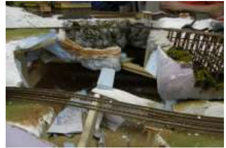
The gorge is being prepared for the placement of the trestle. In the foreground is the future site of Lake McRae.