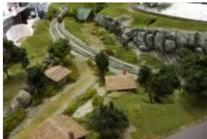
Looking down the country road from the tiny RSLaser Cabins of Aegerter Village toward the RSLaser Lodge now called Camp Annand.