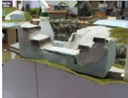
The base for the trestle has been started.