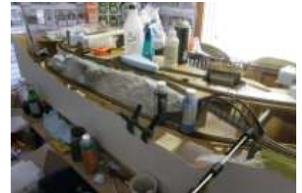
A cross section of the scene shows how Paul builds the scenery on Korchefsky Ridge