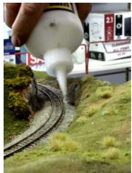
Ballasting is always done with care, after spreading and wetting the ballast, the 50-50 glue/water mix is added to hold it firm.