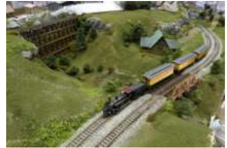
The diminutive 4-4-0 and its three Overland Coaches passes Camp Annand and is crossing the kit-bashed RSLaser Truss.