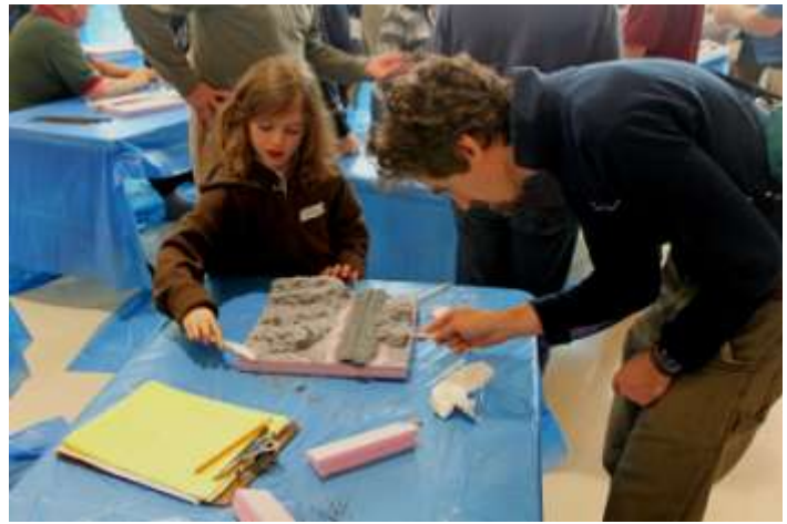
Father and child busy building their scenery with a blob of celluclay.