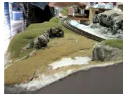
The future site of Aegerter Village