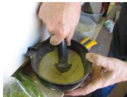
The sand was considered too large for N scale so it was ground smaller with a cast iron mortar and pestle.