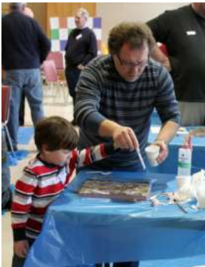
Father guiding his son with the application of diluted white glue over the scenery materials.

The clinics were set up in opposite corners of the hall so they could run simultaneously without interfering with each other. There were four rotations of 15 minutes each (we'll lengthen these to 20 mins for next time), allowing participation in every clinic, with a smaller audience and better opportunity for questions, etc.