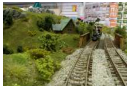
Railfan view of the 4-4-0 crossing the RSLaser Kits kit-bashed Truss bridge.