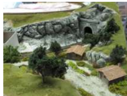
A view looking across tiny Aegerter Village toward one of the lower tunnel portals.