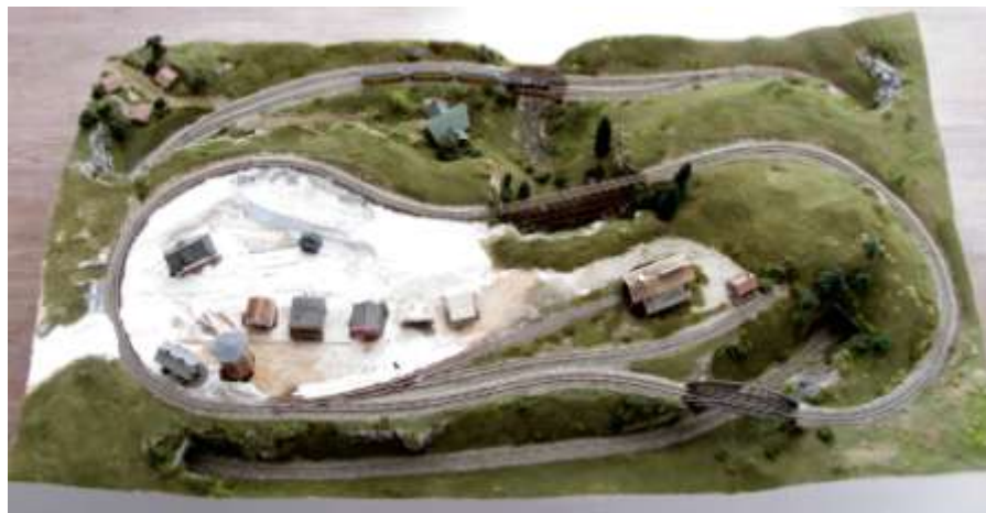
Aerial View after Twelve Days