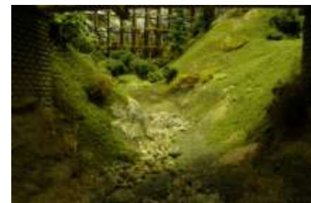
Looking under the truss bridge toward the trestle shows the realistic details Paul added to the scenery.