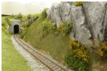
The Lawson`s Landing end of Seymour Pass has been completed.