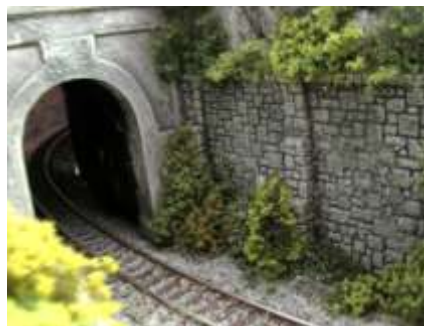
Closeup details at the Lawson's Landing End of Seymour Pass.