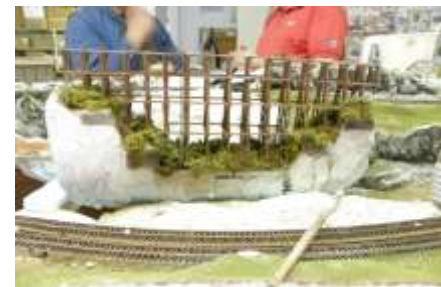
The details under the trestle have been added and the finished scene is about to be put in place.