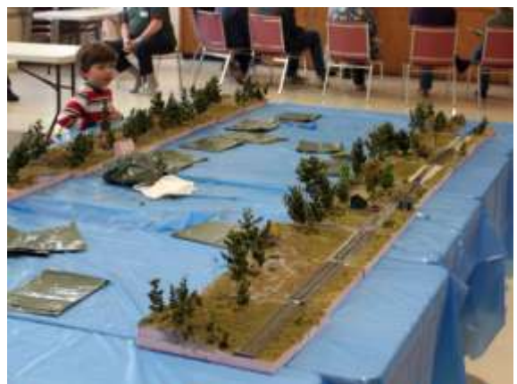
Here are the dioramas lined up for the photo opportunity.

The feedback from the event has been exceptional and included such heart warming comments as "It was