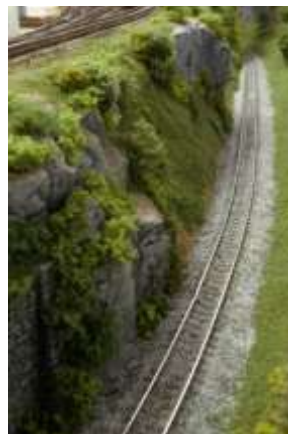
Seymour Pass looking back toward the Korchefsky Ridge end.