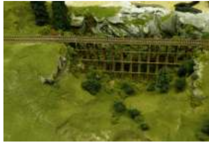
A closer shot of the trestle shows the water barrel platforms and realistic detail of the gorge itself.