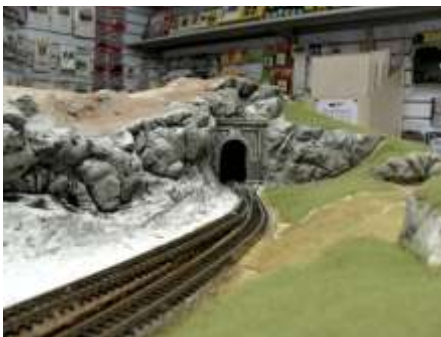
The tunnel portal and hand carved rocks look very real. The dirt road on the right leads to little Aegerter Village.