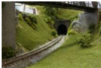
The other Korchefsky Ridge end of Seymour Pass also completed.