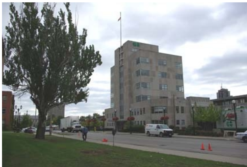
Pictures of the former Hamilton T.H.& B. Train Station and current GO Transit station.